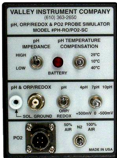
Fig. 1 Front view of simulator