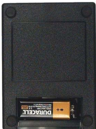
Fig. 2 Rear view of simulator